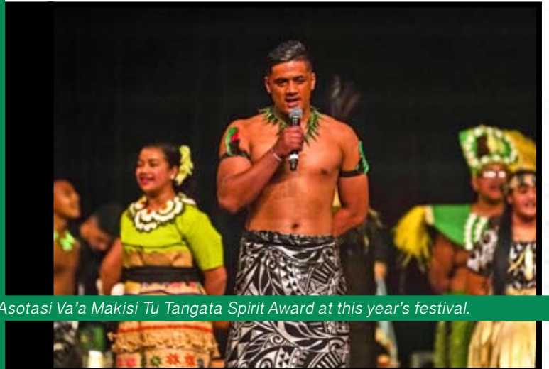
Taita's Poly Group won the prestigious Asotasi Va'a Makisi Tu Tangata Spirit Award at this year's festival.