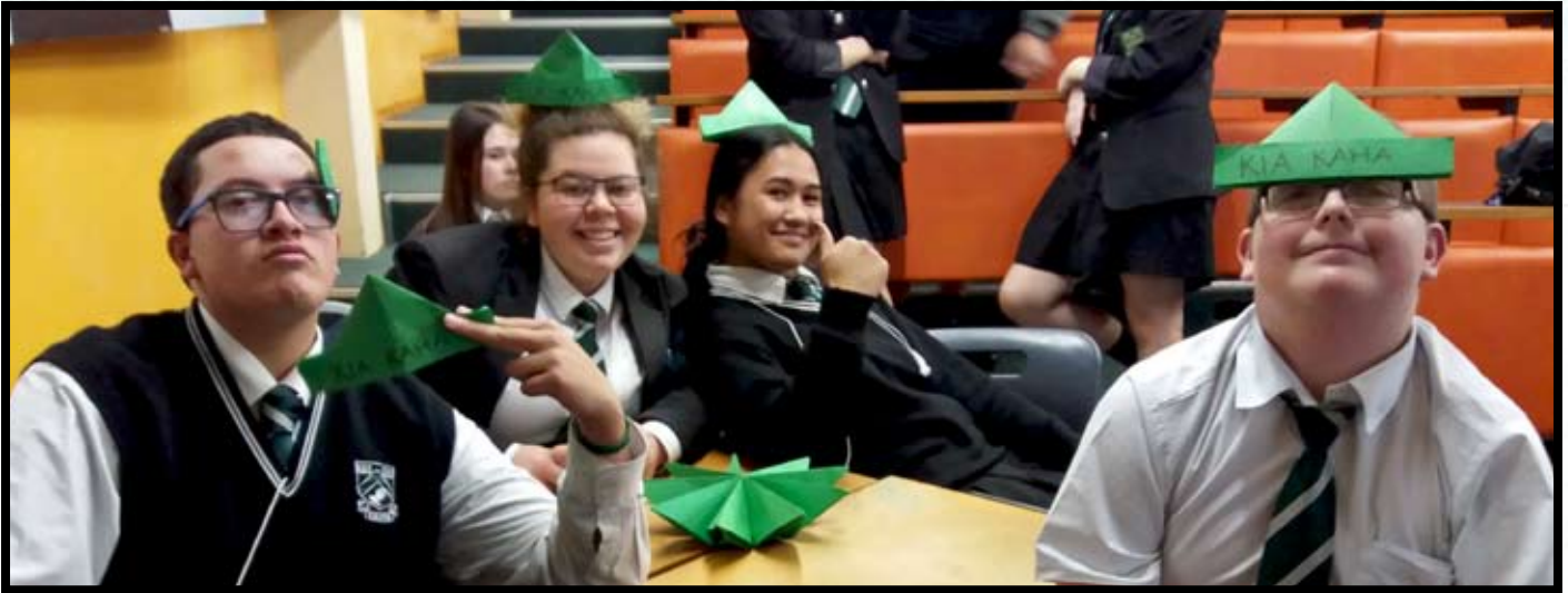
Narraway House being well represented in the Te Reo Quiz as part of Te wiki o te reo Maori, which also included an inter-house spelling bee. The Knowledge Hub also joined in offering te reo scrabble, a translation quiz, colouring-in competition, string games and ti rakau.