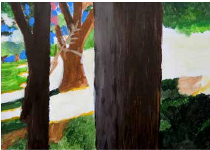
Kyra Ambrose Yr11